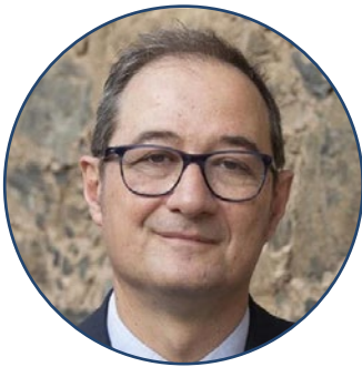
Rector of the Ramon Llull University